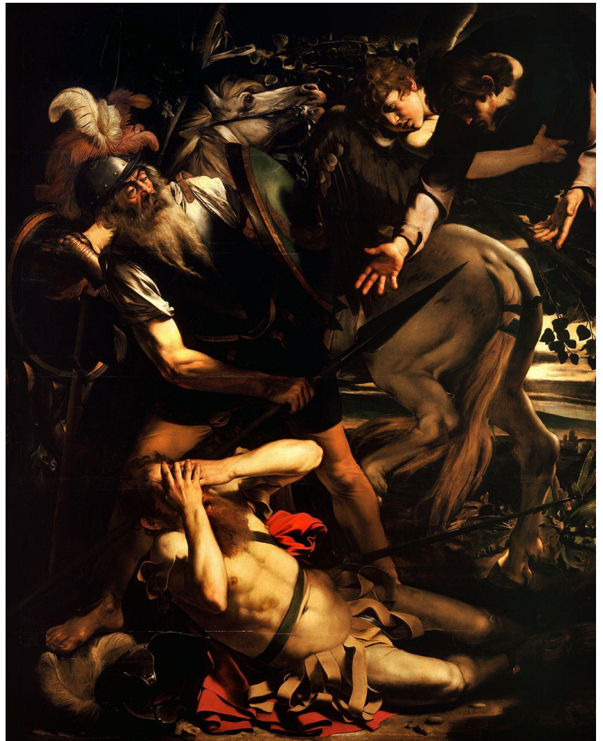
"The Conversion of St. Paul", Michelangelo Caravaggio (Rome, c.1601), Odescalchi Balbi Collection, Rome