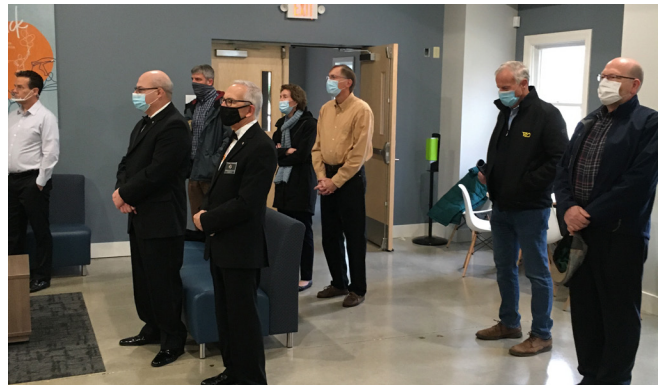
Picture #3 – 4 parishioners and Knights participating in the celebration.