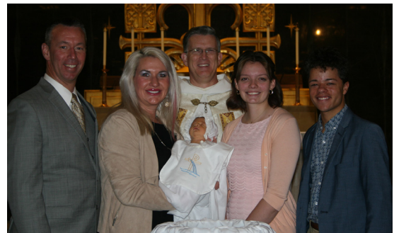
Saturday, November 27, 2021