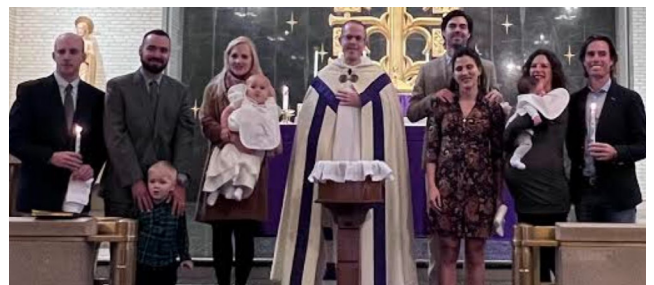
Sunday, November 28, 2021