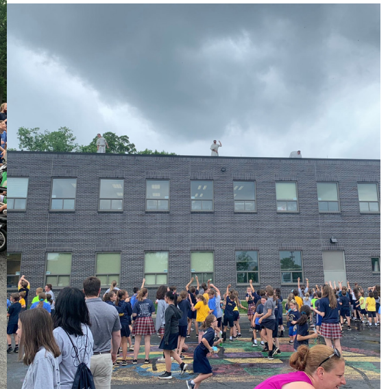
Bulldog Bash and Field Day