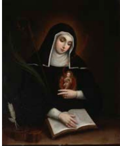
Santa Gertrudis (Cabrera 1763)