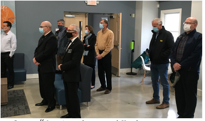
Picture #3 - 4 parishioners and Knights participating in the celebration.