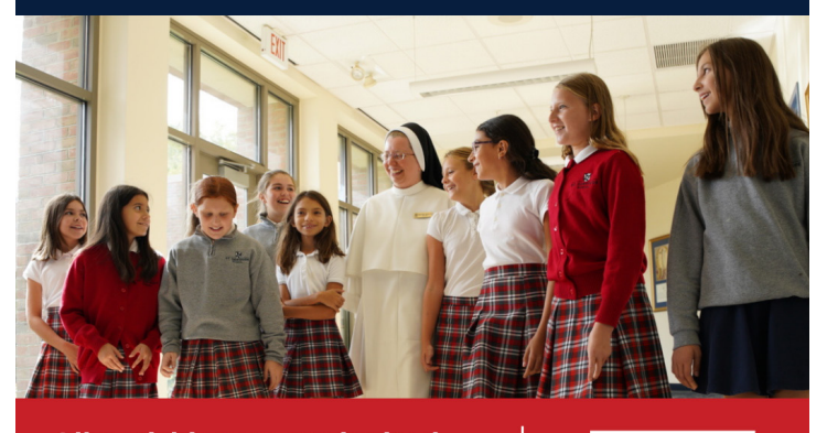
All parishioners are invited to come over to St. Gertrude School after Mass to meet our principal and students, view demonstration classes, and learn more about our terrific parish school!