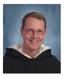
JESUS IS CALLING US TO HIS EUCHARISTIC PRESENCE

(AND SO MANY HAVE HEARD THE CALL. HAVE YOU?)