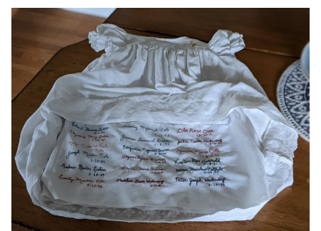
Family baptismal gown

and my grandmother made the gown. I'm not sure she knew then that it would be worn 17 more times over the next 39 years (and still counting).