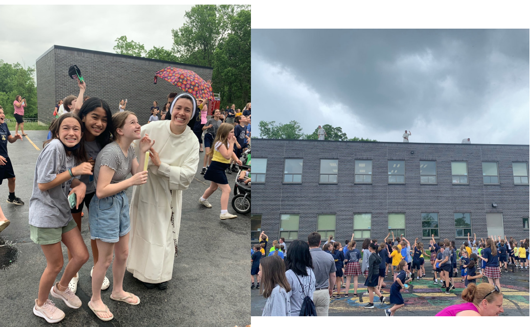
Bulldog Bash and Field Day