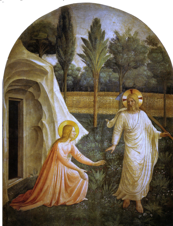
Noli me Tangere, Fra Angelico

Ask a Priest will be a regular format for our Holy Teaching section in the coming months. Submit your own question to parishoffice@stgertrude.org for one of our Dominican priests to answer in the bulletin!