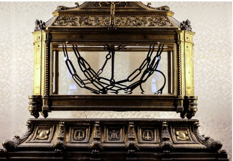
The Chains of St. Pete