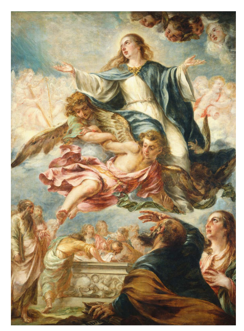
St. Gertrude Roman Catholic Church

Ask a Priest is the regular format for our Holy Teaching section. Submit your own question to bulletin@stgertrude.org for one of our Dominican priests to answer in the bulletin.