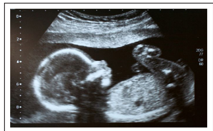
"I assure you, as often as you neglected to do it to one of these least ones, you neglected to do it to me."